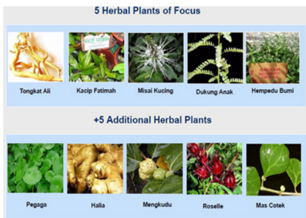
Figure 2. Selected herbal plants for EPP1 program.

Several Herbal Cultivation Parks (HCP) has been in operation since 2011 to ensure sufficient supply of raw herbal material for R and D and clinical trials before mass-production. The targeted high value herbs for Malaysia are described in Figure 2 .