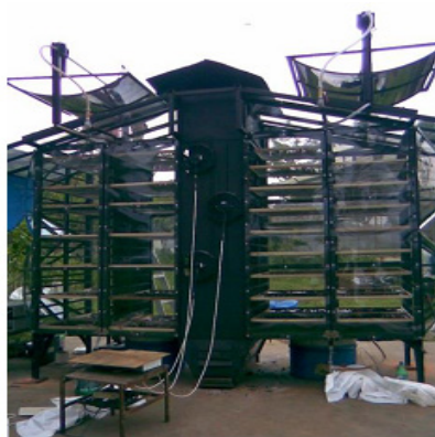
Figure 3(a). Rack-type solar dryer